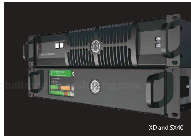
XD and SX40

Additional XD units can be daisy-chained together to extend the signal, allowing screens in different locations to be connected to a single 10G trunk. All ten 1G outputs on each XD can be used, as long as the combined pixel load on all ports of the same number does not exceed the pixel capacity of a single 1G link.