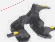
Connection Plate Adjustable -10 to +5° - 2-Way