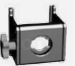
Stacking System Adapter Rear Connector