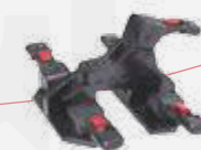
Connection Plate Adjustable -10 to +5° - 4-Way